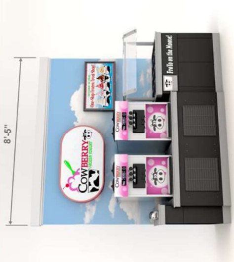
THE “CASH COW MINI 2”