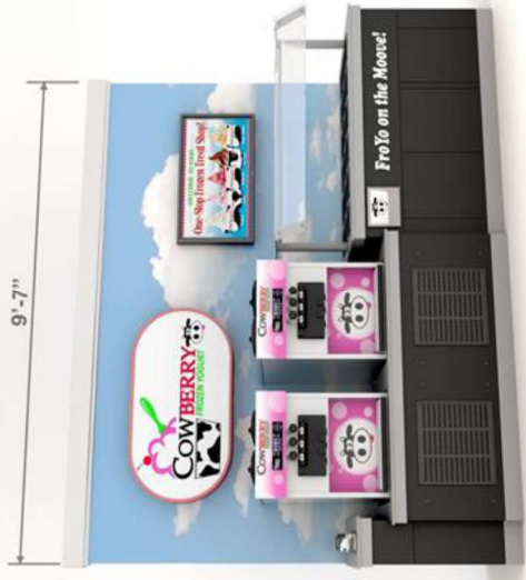
THE “CASH COW 2”