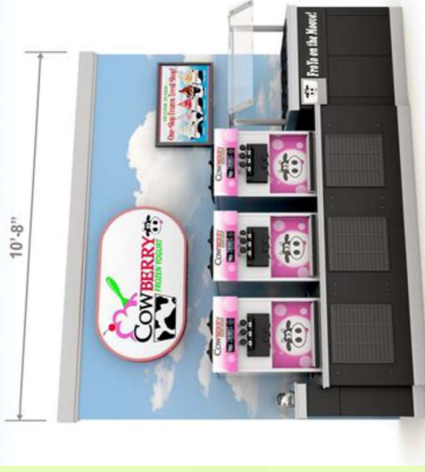
THE “CASH COW MINI 3”