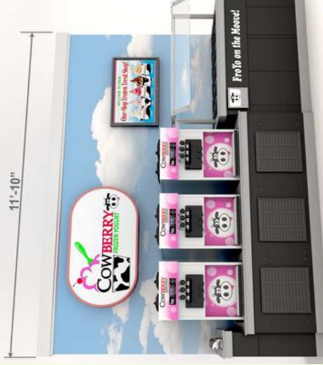
THE “CASH COW 3”